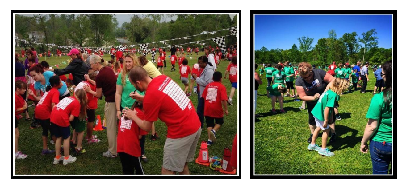
Teachers, Staff, Parents & Volunteers checking off laps ran